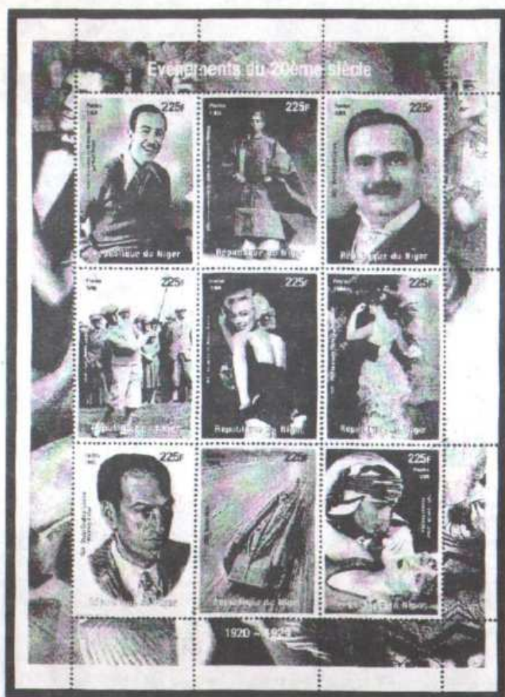
Upper left: Niger

A sheetlet of nine stamps issued December 20, 1998 included one stamp depicting Bobby Jones (left stamp of middle row). Sheetlet also available imperforate.