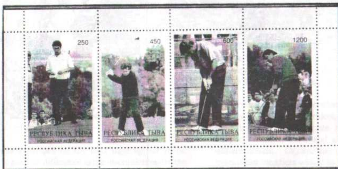
Figure 3: Sheetlet from Tuva

Tuva has issued a sheetlet with four stamps, each depicting a different golf player. From left to right, the players are Jose M. Olazabal, Ian Woofman, Nick Faldo and Nick Price. See the sheetlet below, Figure 3.