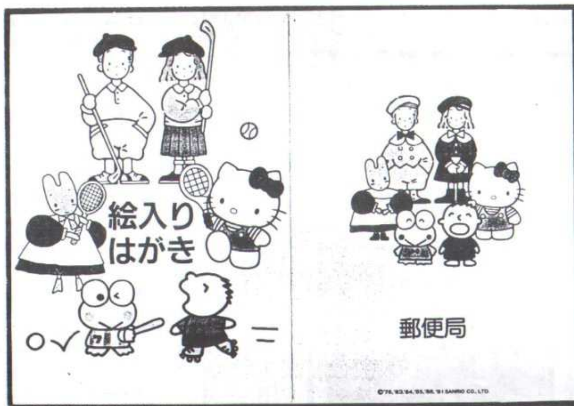
Front and back of folder containing postal card