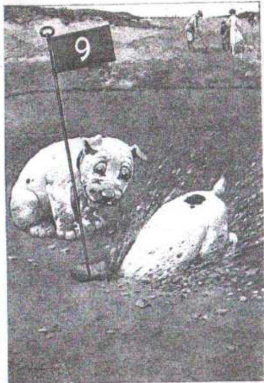
Rabbits, I Believe?