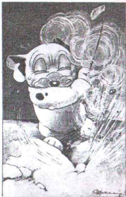
I'M RAISING QUITE A DUST HERE.