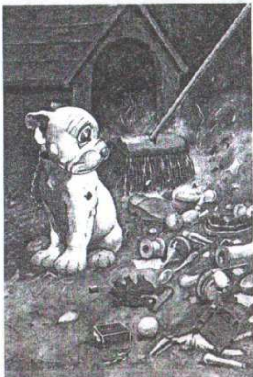
Bonzo's Spring Clean.