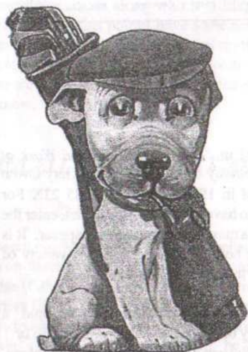
"WHO SAYS GOWF?"