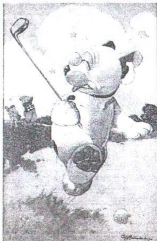
YOU'VE FAIRLY CAUGHT MY EYE!

While there may only be 12 different golf designs, we know those designs exist with a number of variations, i.e., the captions are in different languages, some exist with and without the movable eyes. For example, the one featured on the front of the September issue of Tee Time exists both ways—with and without movable eyes.