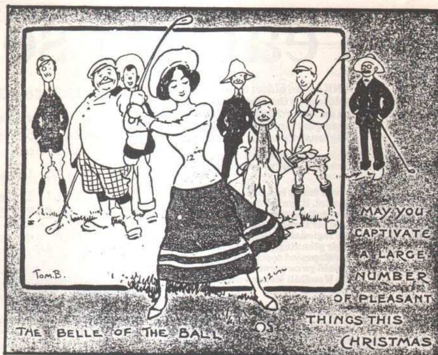
1905 Early Tom Brown Christmas Card