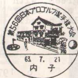
The 56th Japan Professional Golf Championship