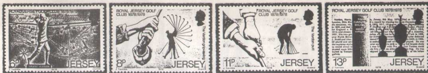
1978 Jersey - Centenary of the Royal Jersey Golf Club