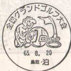
All Japan Ground Golf Tournament

The second kogata-in was used to commemorate the - All Japan Ground Golf Tournament held at Tomari on 20 August 1988.