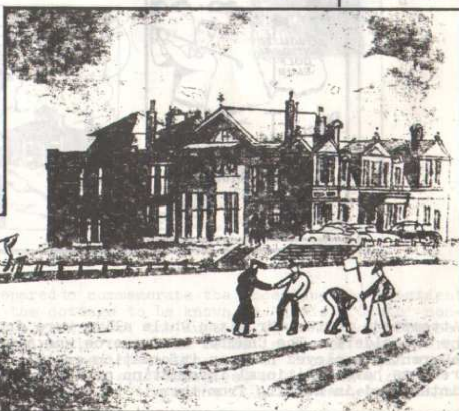
The Royal and Ancient Golf Club of St. Andrews