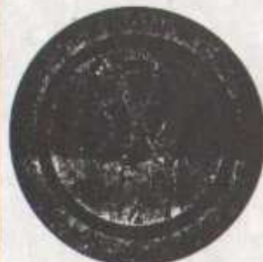
FIRST DAY OF ISSUE I.P.G.S. #1