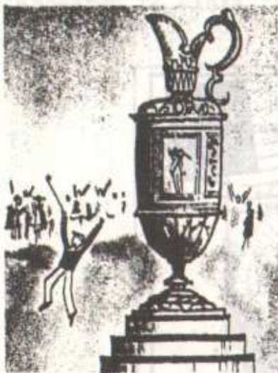
The Open Championship Trophy