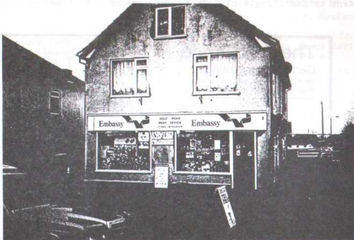
Golf Road Post Office