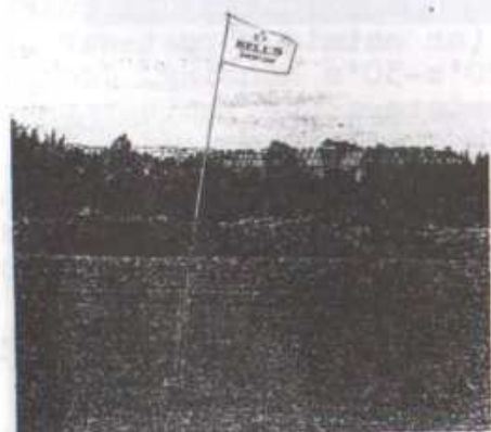
BELL'S SCOTTISH OPEN 6TH - 10TH JULY 1993

The special cancel will be used on the First Day. An Illustration of the proof for the cover and postmark is shown below.