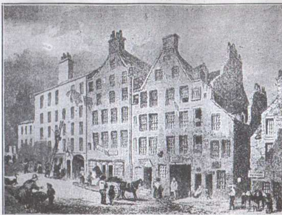
"The Golfer's Land," as seen in an old print.