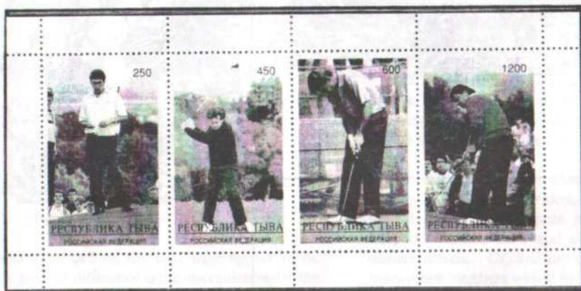
Figure 3: Sheetlet from Tuva