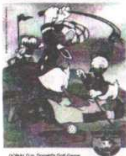
DONALD in Donald's Golf Game

India Issue (Nov. 18, 1991) ..... $ 0.75 Folder with stamp ..... $ 1.50