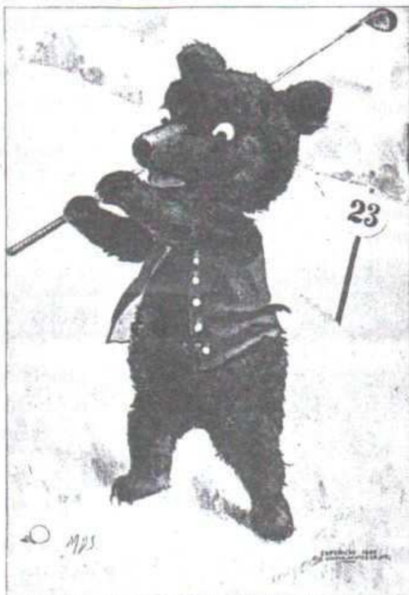
ON THE LINKS.