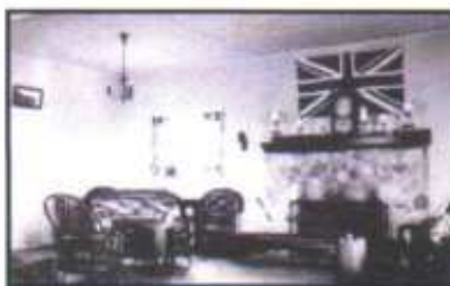
Interior Haileybury Hotel