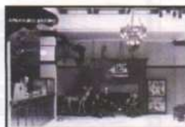
Interior Haileybury Hotel