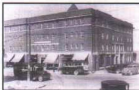
Haileybury Hotel