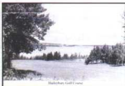
Haileybury Hotel Golf Course