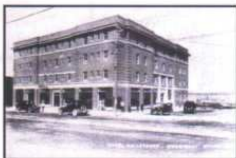
Haileybury Hotel

The Haileybury Hotel was built around 1925 and was demolished in 1983. The golf course was established in 1921 and is one of the oldest golf clubs in Ontario. The course sits on the banks of Lake Temiskaming. The course is 3,000 yards "links style" 9 holes. The 4th hole has a view overlooking Lake Temiskaming. The course is still in use today.