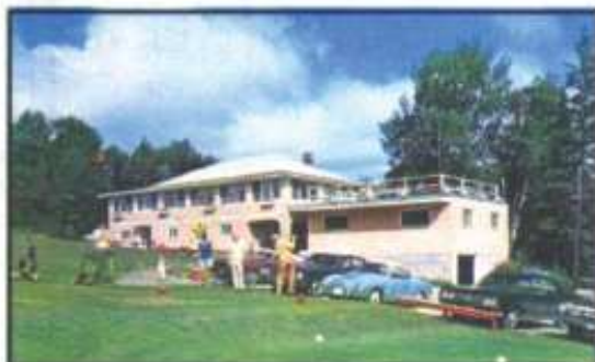
Haileybury Hotel Golf Course 1960's Postcard