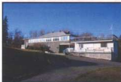
Haileybury Golf Course Today