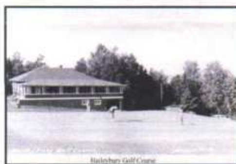
Haileybury Hotel Golf Course