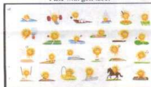
Pane from booklet showing all 24 mascots

24 panes with a 60c stamp and a label depicting 22 different sports, which are:- Aquatics (Swimming), Athletics including Marathon/Half-Marathon, Badminton, Basketball, Bocce, Bowling, Cycling, Equestrian, Football (5-aside, 7-aside, 11-aside), Golf, Gymnastics, Handball, Judo, Kayaking, Power-lifting, Roller Skating, Sailing, Softball, Table Tennis, Tennis, Volleyball, Beach Volleyball