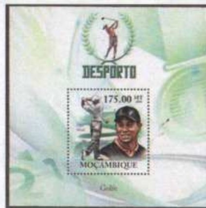
2024 Tiger Woods

Date of Issue: March 31 2010 Desporto—Tiger Woods