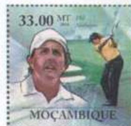
1997e Phil Mickelson