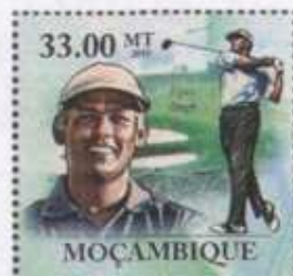
1997c Vijay Singh