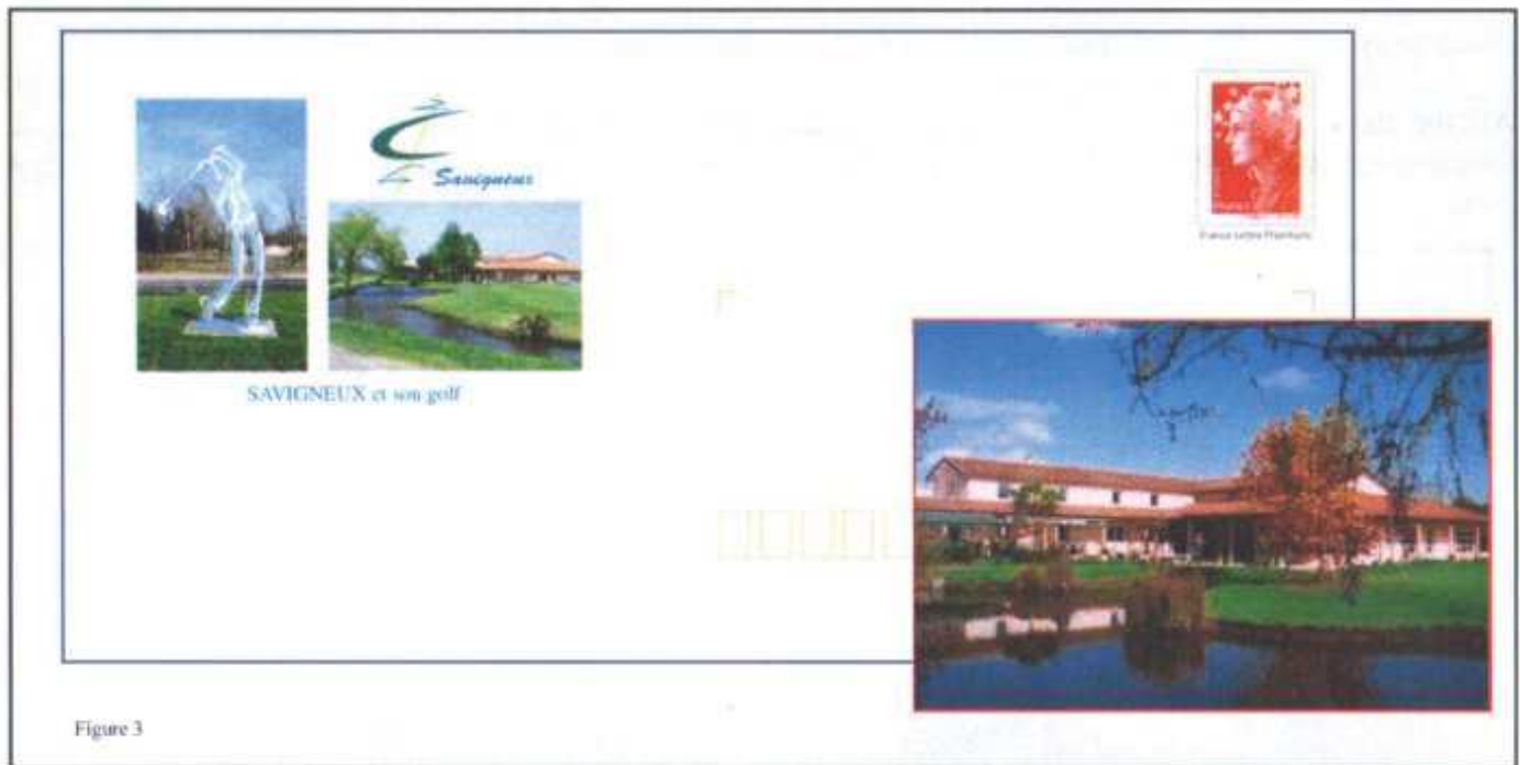
Figure 3: Savigneux, a town of 1100 inhabitants in the Rhone-Alps Region. Savigneux and Golf. Insert: Golf Les Etangs Clubhouse.