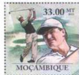
1997f Ernie Els

The sheet also shows an image of Lorena Ochoa.