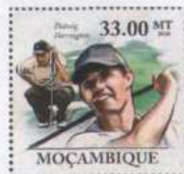
1997b Padraig Harrington