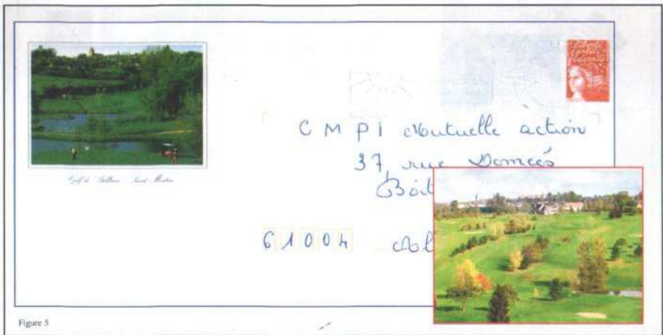
Figure 5. Belleme. Town of 1500 persons in the Region of Lower Normandy. Golf course near castle . Cancelled on March 22, 2001. Insert: Golf de Belleme, Saint Martin.