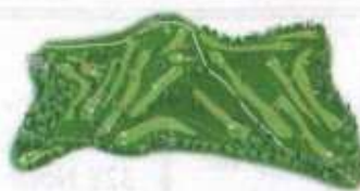
Le Mont Saint Jean