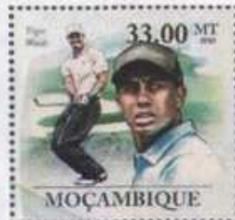
1997d Tiger Woods