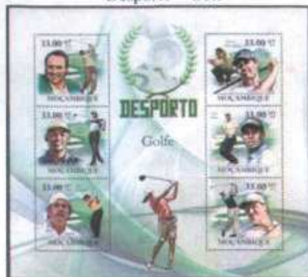
1997 Sheet of 6 golfers

Date of Issue: March 31, 2010 Desporto—Golf