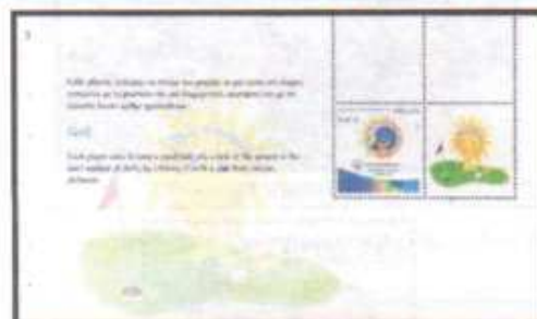
Pane with golf label