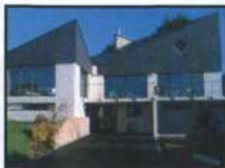
The new club house

Golf Course de Brest Iroise consists of a nine hole and 18 hole nestled in a 600 acre park.