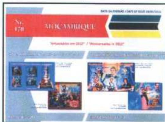
A recent new issue brochure from Stamperija

So, if Stamperija is producing legitimate stamps for postal use, why does Scott list only a few? After all, Stamperija is no different than the Inter-Governmental Philatelic Corp (IGPC) in New York. They produce and sell stamps for many African and Caribbean countries (Bequia, Canoun, Mayreau, Mustique). And, again, most of these stamps are produced for sale to stamp collectors and very few are sold in the issuing countries post offices. All these "stamps" are all listed in Scott's catalogues.