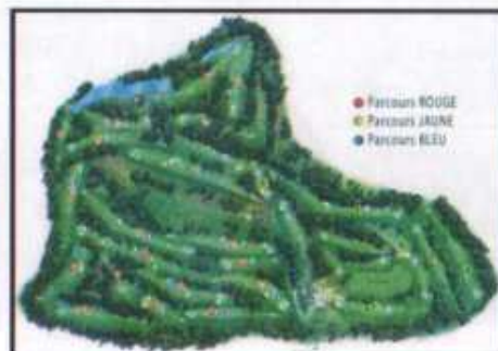
TEE TIME 3