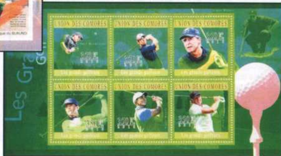
Comores December 15, 2010