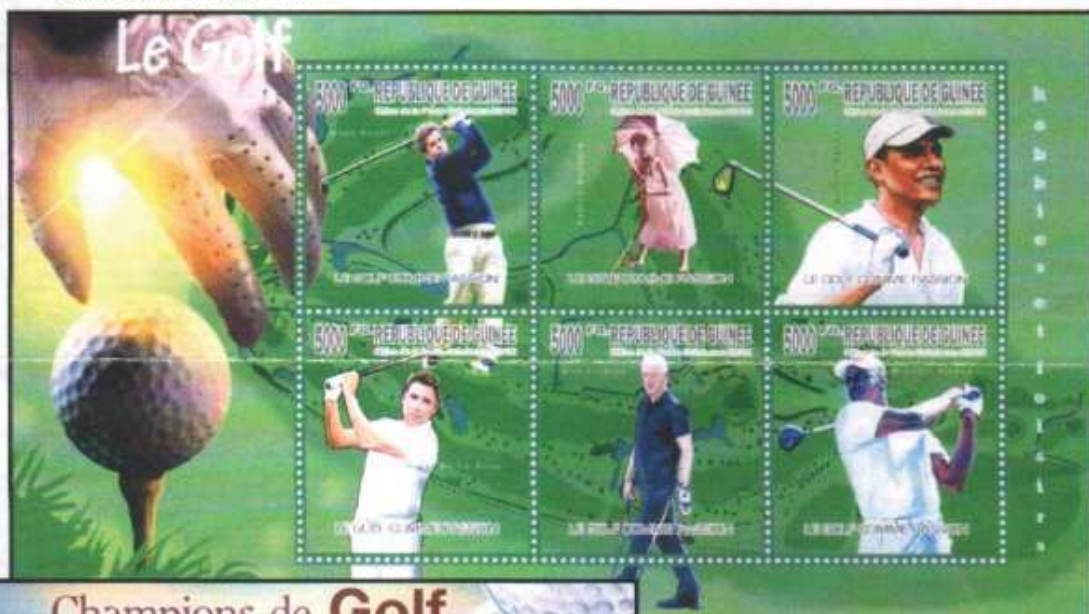
Guinea June 15, 2010