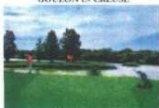
Golf de la Jonchère