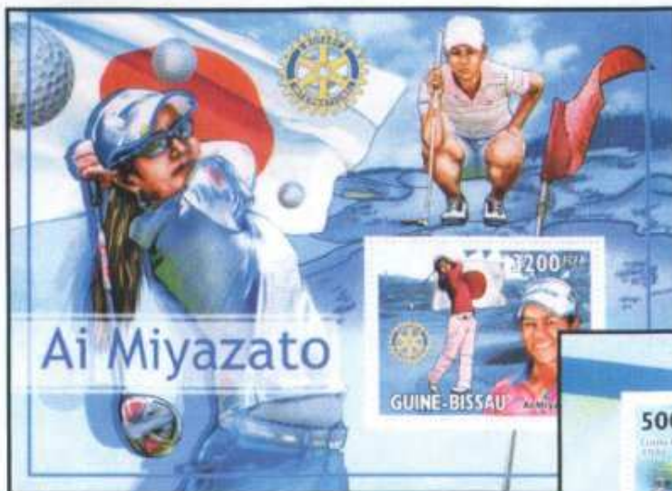
Guinea-Bissau August 10, 2010