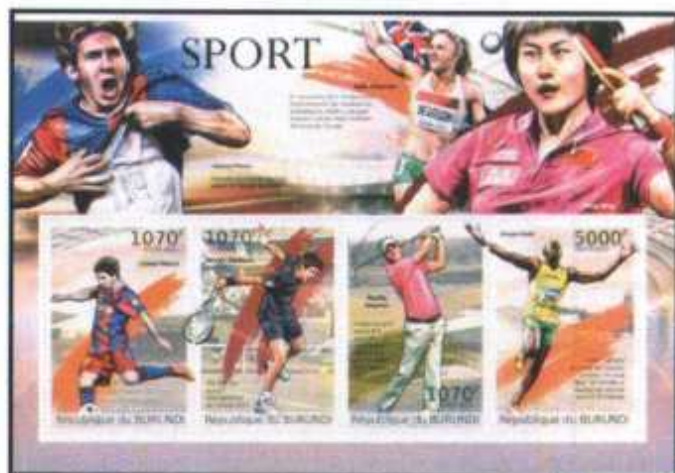
Burundi December 30, 2011

We are illustrating the golf stamps produced by Stamperija in the past couple of years.