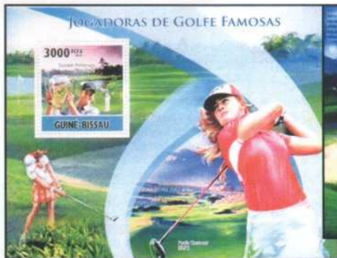
Guinea-Bissau November 11, 2010