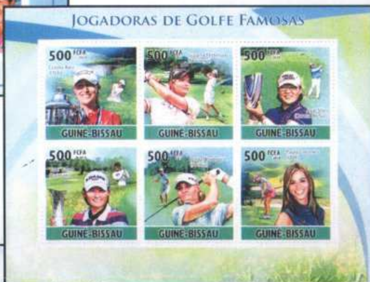
Guinea-Bissau November 11, 2010