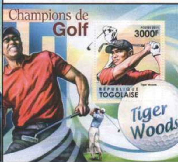
Togo February 20, 2012