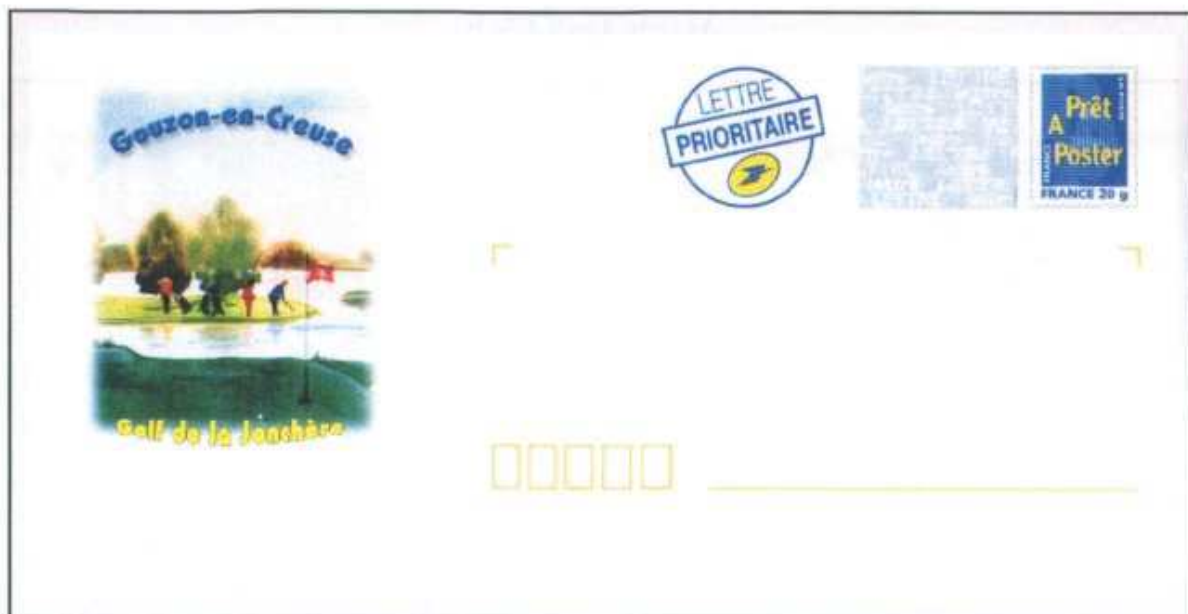
A second envelope issued for Gouzon en Creuse