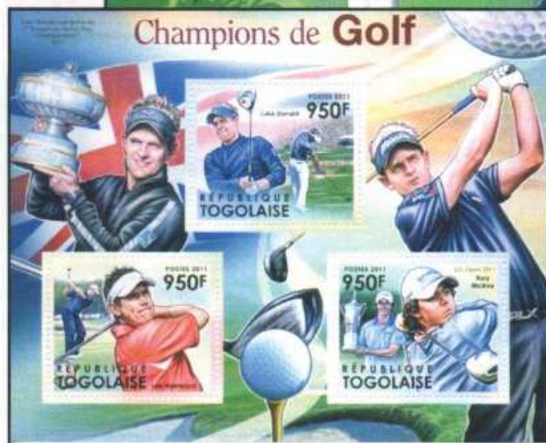
Togo February 20, 2012