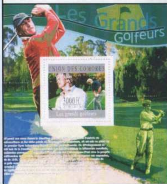
Comores December 15, 2010