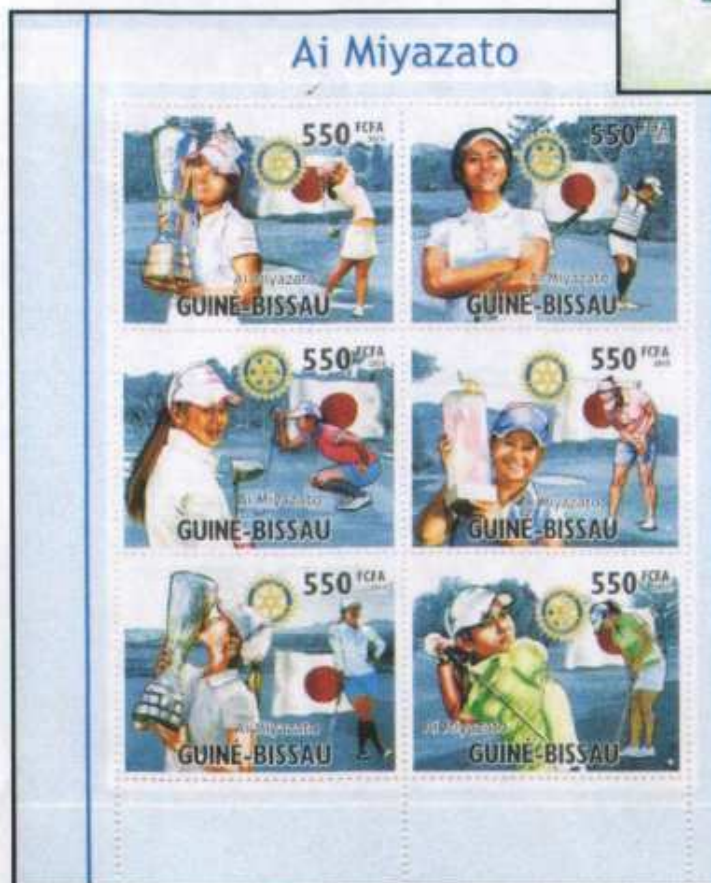
Guinea-Bissau August 10, 2010