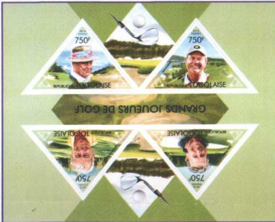
Gary Player—Arnold Palmer - Sam Snead - Jack Nicklaus