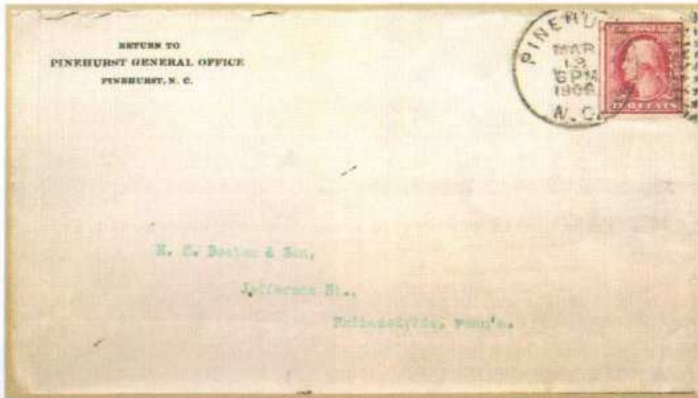
Fig. 2 The first cover with a return address of the Pinehurst General Office was used in 1908—the first year perfins were authorized for use in the United States.