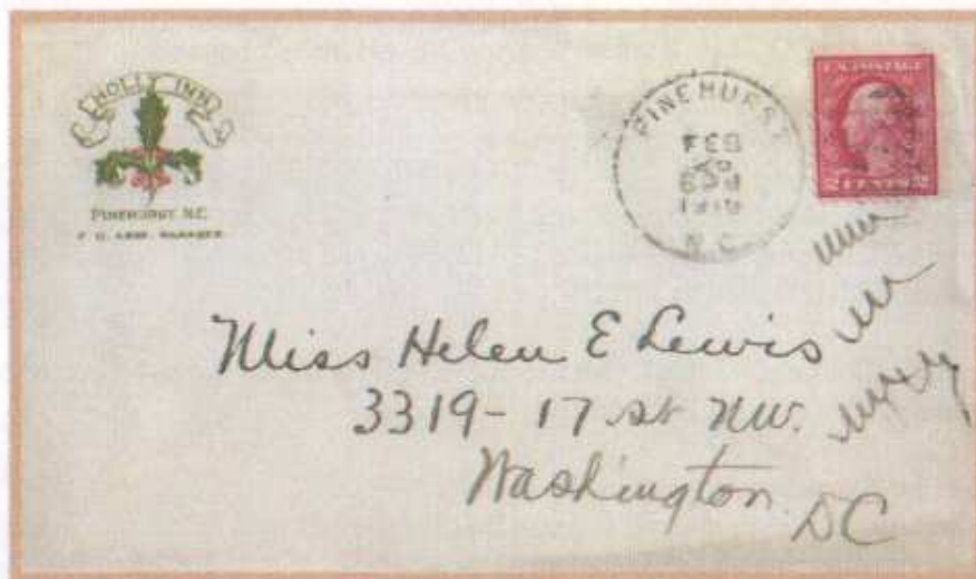
Fig. 3 The second cover (which I recently purchased on ebay) is dated 1916 and used on a Holly Inn cover. Holly Inn was the first hotel built on the Pinehurst property. It opened December 31, 1895 and still exists today.