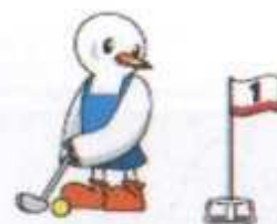
Mascot emblem used for handicapped golf athletes.