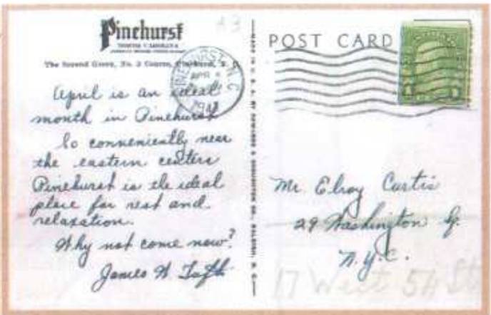
Figures 7 & 8 Second Green, No. 3 Course, Pinehurst, N.C. (1941)