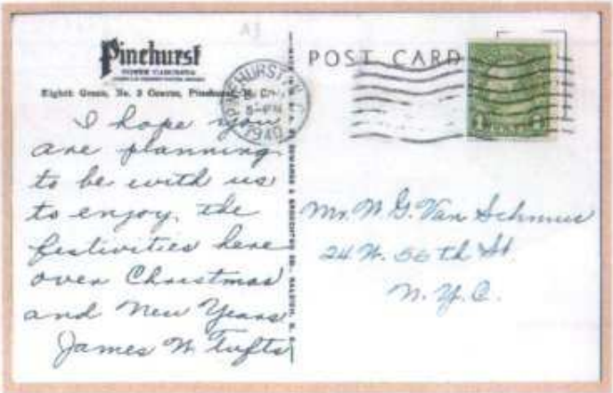
Figures 5 & 6 Eighth Green, No. 3 Course, Pinehurst, N.C. (1940)