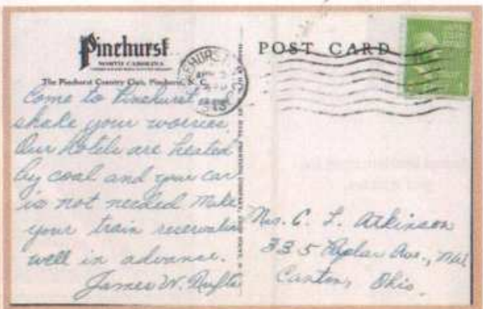
Figures 9 & 10 The Pinehurst Country Club (1943)