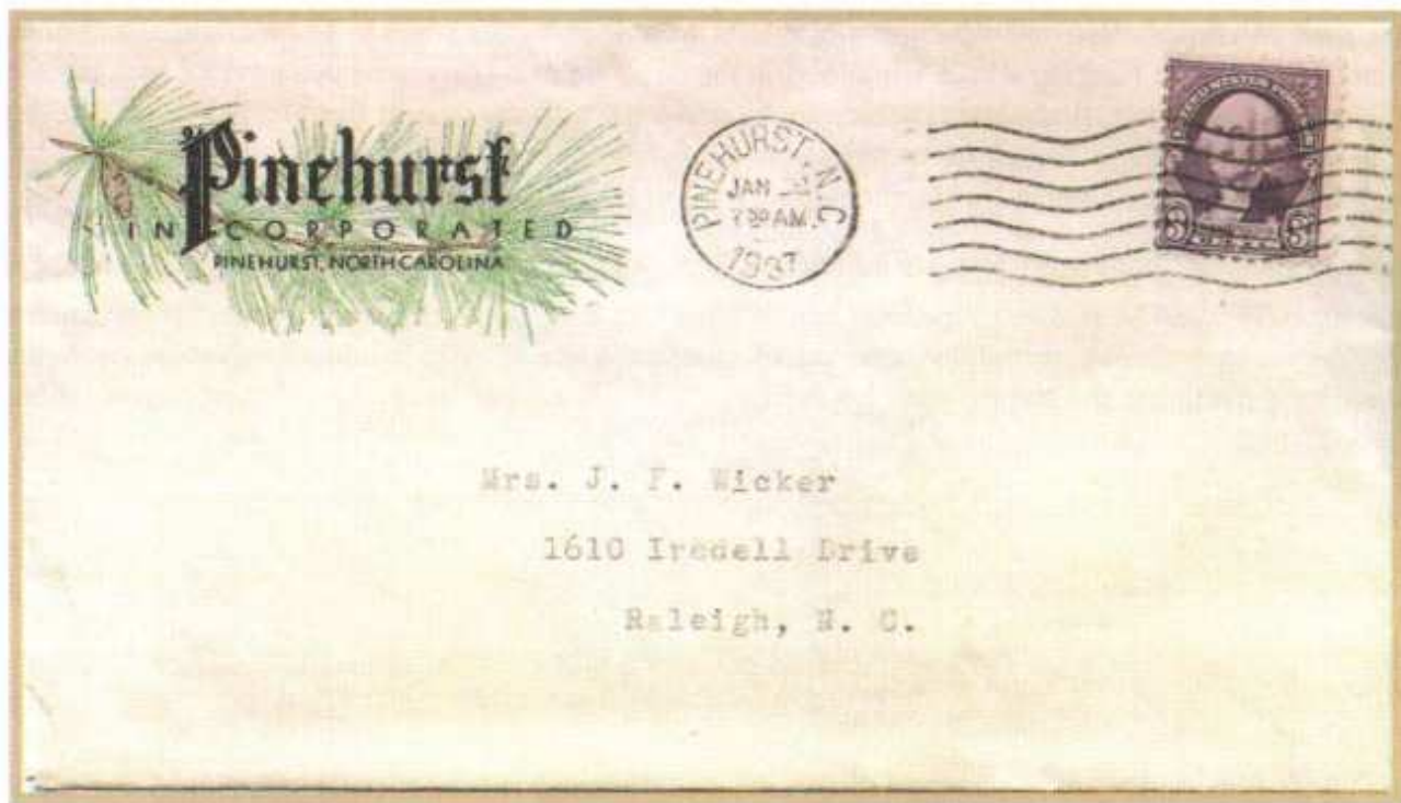
Fig. 4. "LT" Perfin used on a corner card for the Pinehurst Corporation in 1937.